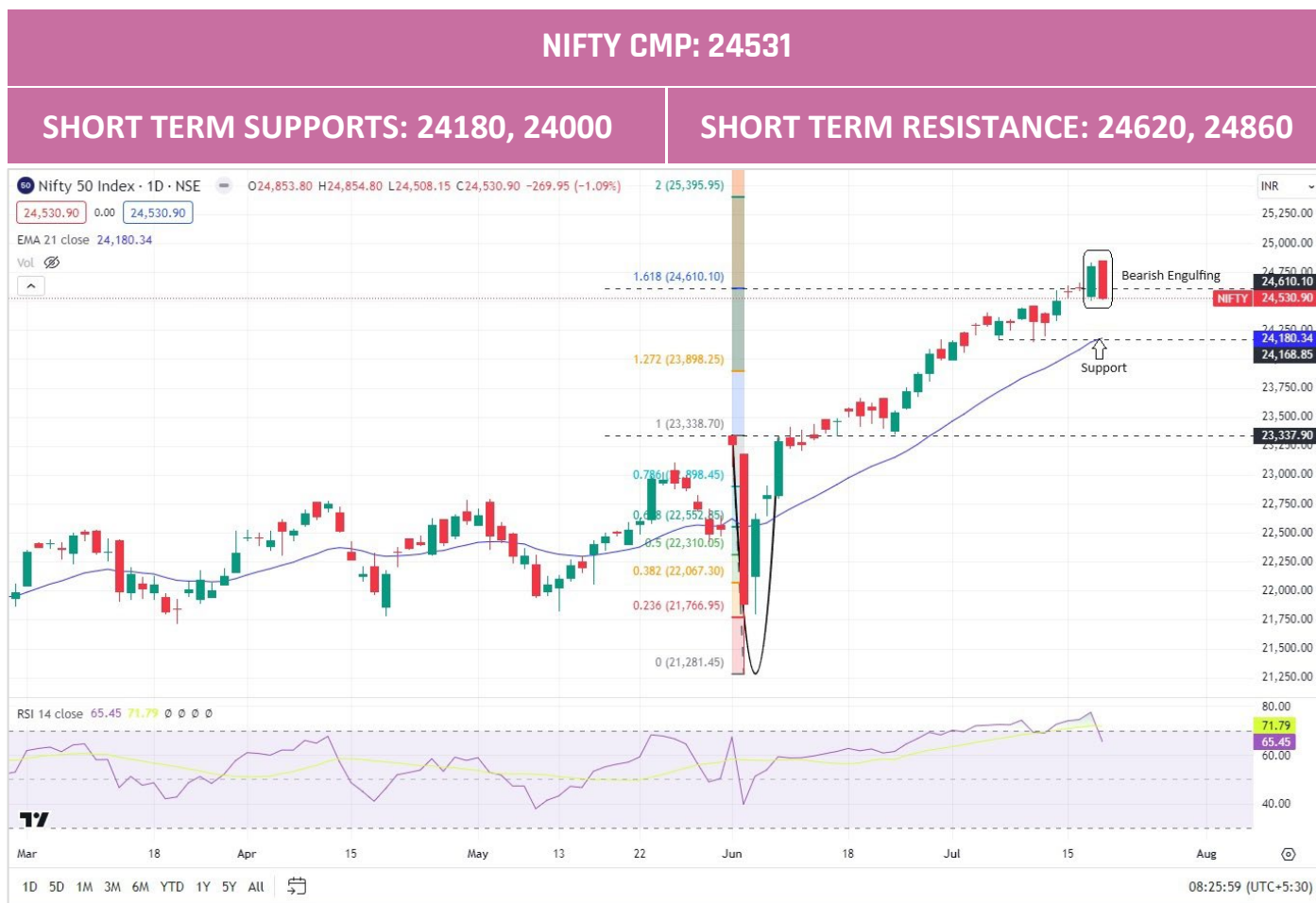
Chart as on 19 th July 2024