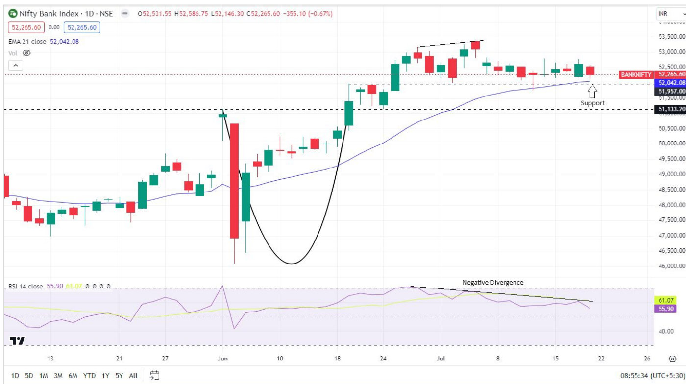
Chart as on 19 th July 2024