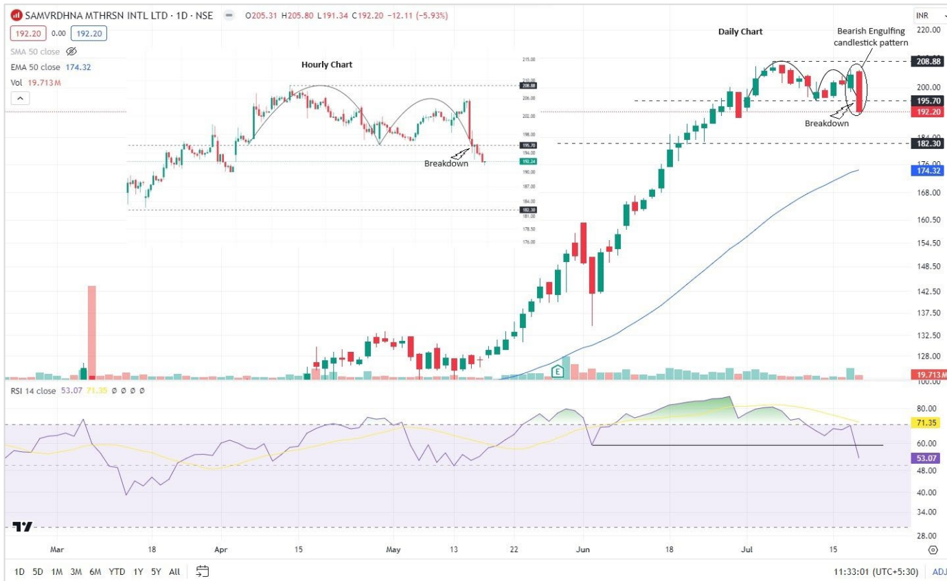
Chart as on 19 th July 2024